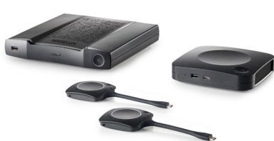
Barco ClickShare Conference