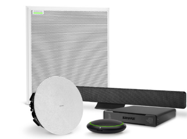
Shure Microflex Ecosystem