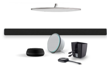
Shure Stem Ecosystem